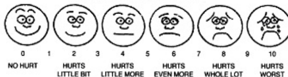
Wong Baker Face Scale

No Pain 0 — 1 — 2 — 3 — 4 — 5 — 6 — 7 — 8 — 9 — 10 — Unbearable Pain